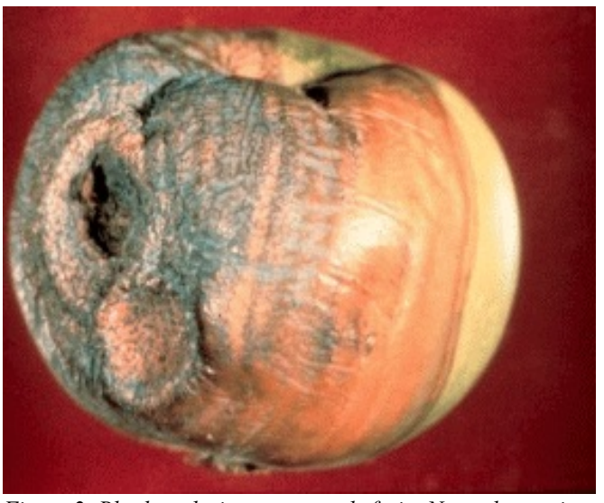
Figure 2. Black rot lesion on an apple fruit. Note alternating black and brown concentric rings and pycnidia.

Black, pimple-like fruiting bodies (pycnidia) of the causal fungus appear on the surface of a rotted fruit (Figure 2). In cold storage, the flesh of fruit infected with black rot remains firm, in contrast to several other apple rots.