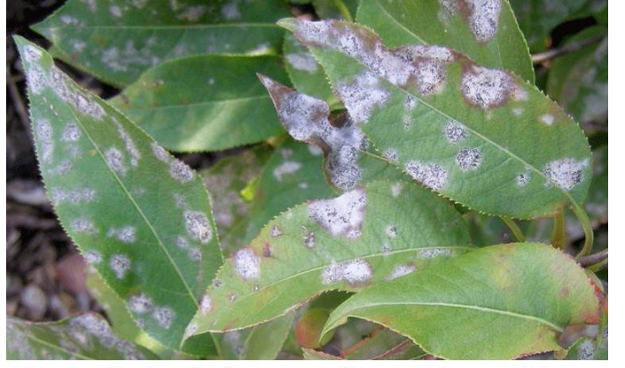
Figure 3. Apple leaves with powdery mildew.

P. leucotricha overwinters as mycelium in dormant flower and shoot buds infected the previous year. In spring, the infected buds break dormancy and the fungus resumes growth, colonizing the developing shoots and