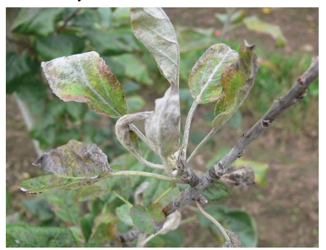
Figure 2. Apple shoot and leaves with powdery mildew.

On Leaves. Leaves are colonized as they emerges from the buds. White fungal colonies develop on