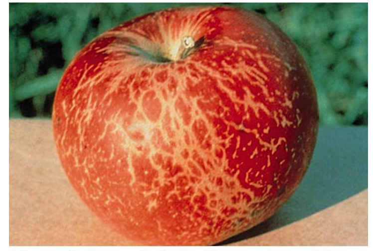
Figure 4. An apple fruit with powdery mildew.

Mildew infected buds are more susceptible to freezing than healthy buds. At 15°F or colder, most infected buds are killed.