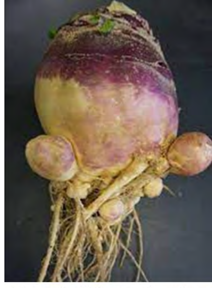
Figure 3. Club root of rutabaga.

Many aspects of biology of P. brassicae remains unresolved, especially the link between development of primary plasmodia in root hair cells and the later production of secondary plasmodia with the root cortex. Most resting spores of the pathogen are concentrated in the upper soil profiles, the concentration decreasing with depth. Spore dissemination is via drainage and irrigation water, materials originating from infested roots, and wind-borne soil particles. Contaminated transplants are a major means of long-range spread. Resting spores can remain viable in