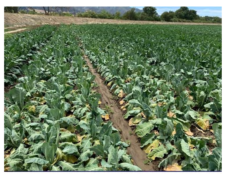
Figure 1. Localized area in a cauliflower field with clubroot pathogen.

Clubroot, caused by Plasmodiophora brassicae , is an important disease of brassicas. The disease was first identified in the 1870s in St. Petersburg, Russia. Clubroot is a soilborne disease and is present in all brassica-producing countries, particularly in humid, temperate regions. The pathogen attacks the roots of cabbage, cauliflower, broccoli, Brussels sprouts, turnip, radish, mustard, oilseed ape, and rutabaga. Clubroot reduces yields, quality, and palatability of stock-feed brassicas. The pathogen can survive in the soil up to 20 years. Clubroot symptoms are specific to brassicas, but the pathogen also capable of invading root hairs of nonbrassica plants, including grasses and dicotyledons.