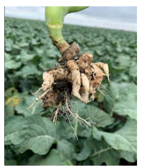
Figure 2. Clubbing of broccoli roots (Courtesy NCSU).

Typical clubroot symptoms are swelling and contusion of the host roots and hypocotyl. Fibrous-rooted cole and oilseed crops form a mass of coralloid galls when infested (Figures 1 and 2). Galls on hypocotyls of rutabaga and turnip may partially or completely cover the surface and also affect the taproot and secondary roots (Figure 3). The extent of galling varies with plant age, morphology of roots, and more importantly, the period over which the plant is exposed to infection and reinfection. Once clubs being forming, growth is almost entirely directed to the swelling galls. Only rarely are infected plants killed, but they have fewer, smaller leaves and blue-green foliage and show wilt symptoms under even light water stress. Early in the season, the galls are firm and white inside; later they turn brown and start to decay.