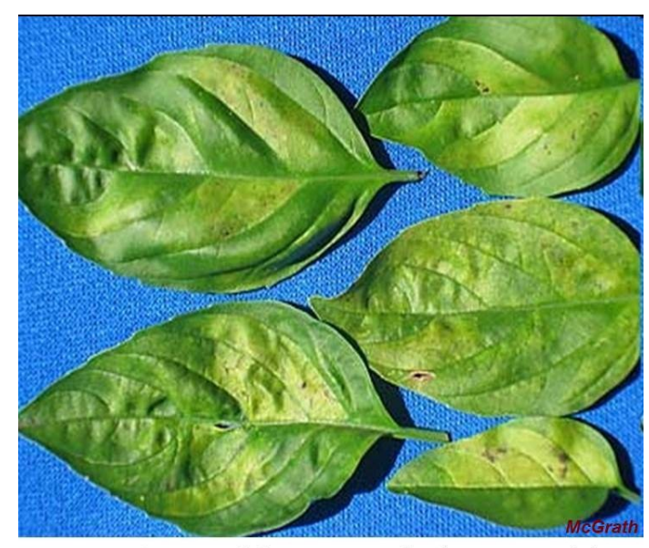
Figure 2. Basil leaves with downy mildew showing yellowing of the upper surfaces.

Peronospora belbahrii is an obligate parasite which means that it survives in infected plant tissues. The pathogen may overwinter as oospores (thick-walled resting spores) in the absence of host plants, but it needs two different mating types to produce oospores. Only one mating type of the pathogen has been found in the US. As a result no oospores are formed and the pathogen will not be able to survive in the fields in Illinois in winter. This may change if the second mating type of the pathogen is introduced