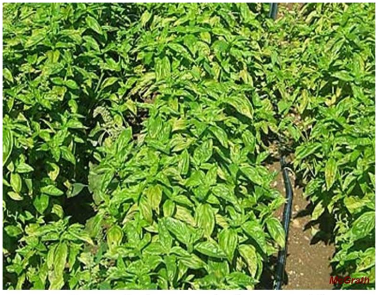
Figure 1. Basil plants with downy mildew. Note leaf chlorosis.

Florida in 2007 and was observed in Illinois in 2009. Since 2009, downy mildew occurred in Illinois and most of the other basil growing areas of the United States (US) every year. Downy mildew had been reported in Uganda in 1933, Switzerland in 2001, Italy in 2003, and Belgium and France in 2004. P. belbahrii can be seedborne and distributing contaminated seed is a plausible way of spreading the pathogen in the world. Recently, downy mildew of basil has been reported from basil growing areas in Africa, Asia, Australia, Europe, and North and South Americas.