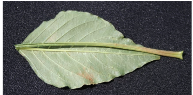
Figure 3. A Palmer amaranth petiole bent back over the leaf blade, demonstrating the length of its petiole.