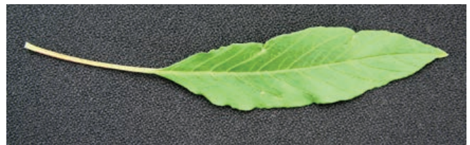
Figure 4. The linear, lance-shaped leaf blade and short petiole characteristic of common waterhemp.