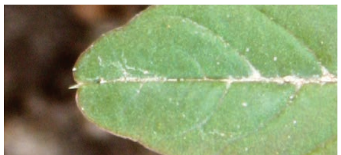
Figure 13. Some Palmer amaranth plants have a single hair in the leaf tip notch.