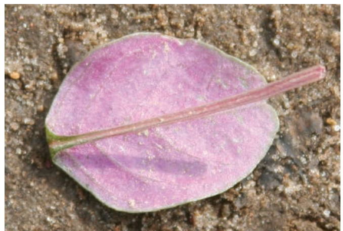
Figure 9. Note the petiole of this Palmer amaranth seedling is longer than the leaf blade when bent back over the blade.