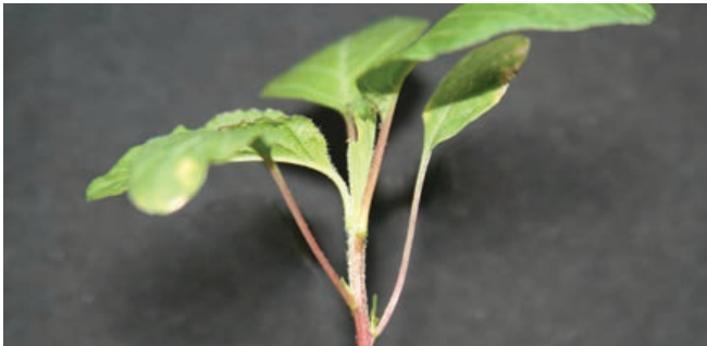
Figure 1. Redroot and smooth pigweeds have hairs on their stems and leaf surfaces. These hairs distinguish them from common waterhemp and Palmer amaranth.

Only redroot and smooth pigweeds have hairs (pubescence) on their stems and leaf surfaces (Figure 1). The fine hairs will be most noticeable on the stems towards the newest growth. Palmer amaranth and common waterhemp do not have hair on any surface. Looking for pubescence is a quick and easy way to differentiate redroot and smooth pigweeds from the other two amaranths.