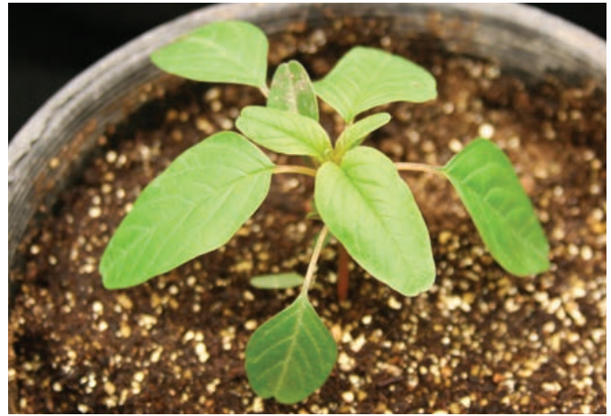
Figure 7. Young Palmer amaranth seedlings exhibit an extended petiole on the first true leaves.