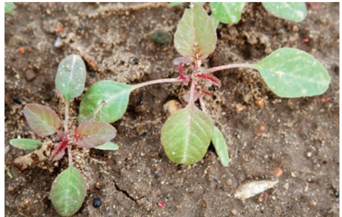
Figure 8. A Palmer amaranth seedling. Note the extended petiole on the first true leaves.