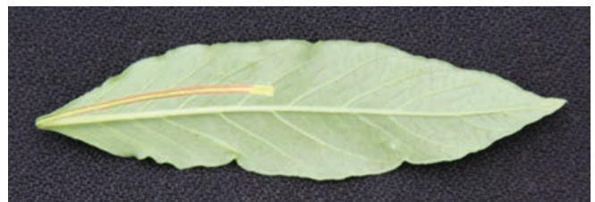
Figure 5. A common waterhemp petiole bent back over the leaf blade, illustrating the length of its petiole.