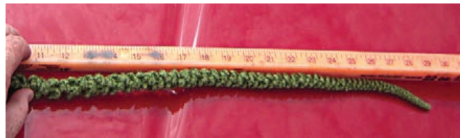
Figure 11. A Palmer amaranth seed head measuring close to 30 inches long.