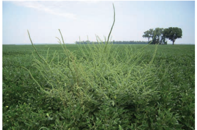
Figure 10. A Palmer amaranth plant growing in soybean with multiple terminal seed heads.

The presence of stiff, pointy bracts on the female seed head and leaf axils can lead to confusing Palmer amaranth with spiny amaranth or spiny pigweed ( Amaranthus spinosus ). Spiny amaranth is predominantly a weed of pastures, livestock holding pens, and feeding areas; it is rare in agronomic fields. Spiny amaranth has a bushy growth pattern and exhibits the spiny bracts throughout its life cycle, whereas Palmer amaranth exhibits the bracts only at maturity and during reproductive stages.