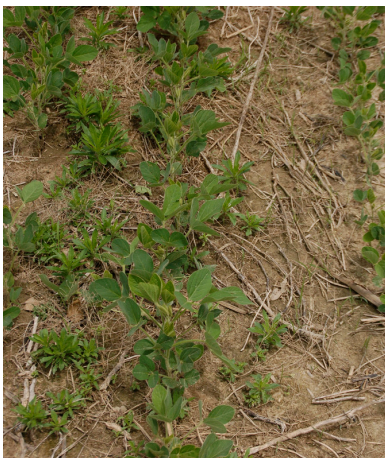
Left photo - spring application of glyphosate + 2,4-D + residual herbicides (no fall herbicide treatment)

Maybe - but this is not an approach that has consistently worked well (see photos below). It can be difficult to accomplish unless the marestail population in the field has been well managed for several years and the population is generally low. Growers should use their own previous experiences here as guidance, and plan on increasing the complexity and rates of the herbicide program. Problems with skipping the fall treatment, and applying everything at once in spring include the following: 1) applying early in spring when plants are small can result in poor control of plants that are emerging in mid-season if the residual herbicide runs out; and 2) applying closer to planting to maximize the length of residual often results in less effective control of larger, older marestail plants, especially those that have overwintered.