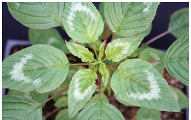
Figure 12. Some Palmer amaranth leaves have white chevron or V-shaped watermarks.