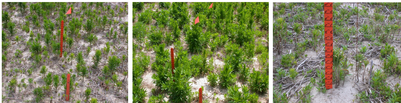
Photos: multiple-resistant marestail surviving treatment with (from left to right): glyphosate alone, ALS inhibitor alone, and a combination of ALS inhibitor and glyphosate