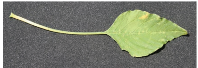
Figure 2. A Palmer amaranth leaf blade with extended petiole.

This is the most consistent and reliable characteristic that differentiates Palmer amaranth from common waterhemp, and it is most evident on the oldest leaves of plant (lowest on the stem). Leaf shape, leaf watermark, and leaf tip hair characteristics will help confirm the identity of Palmer amaranth; however, these characteristics are much more variable within species and can make correct identification difficult and frustrating if used alone.